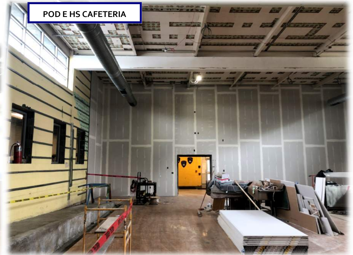
POD E HS CAFETERIA