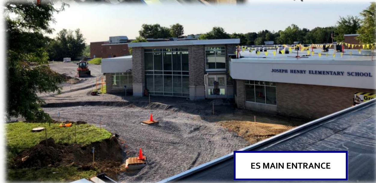
ES MAIN ENTRANCE