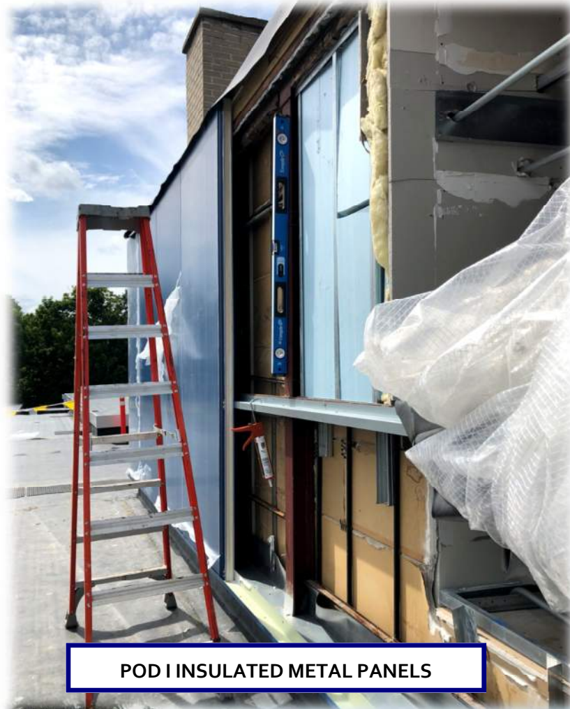
POD I INSULATED METAL PANELS