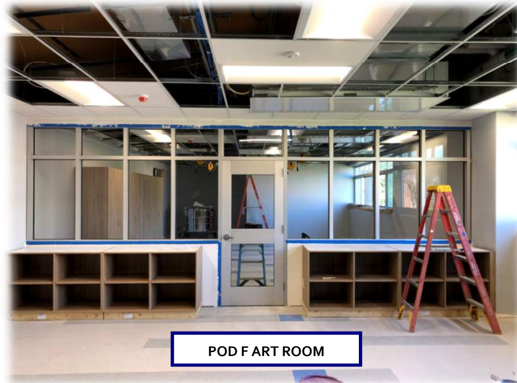
POD F ART ROOM