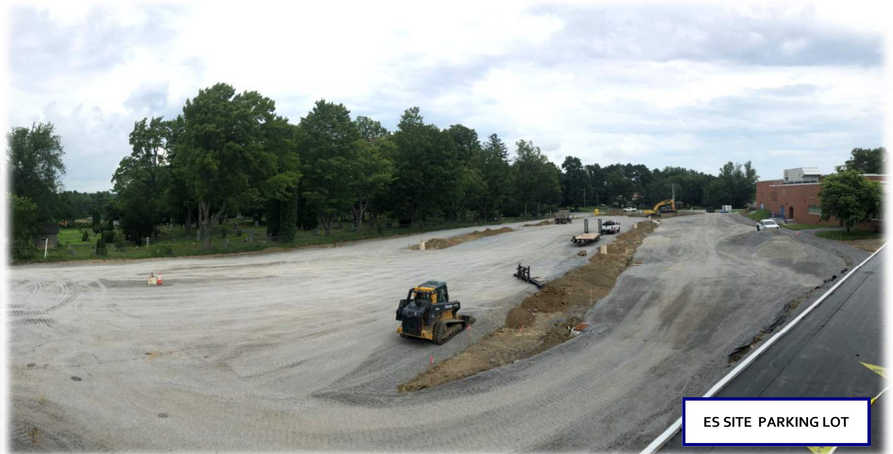
ES SITE PARKING LOT