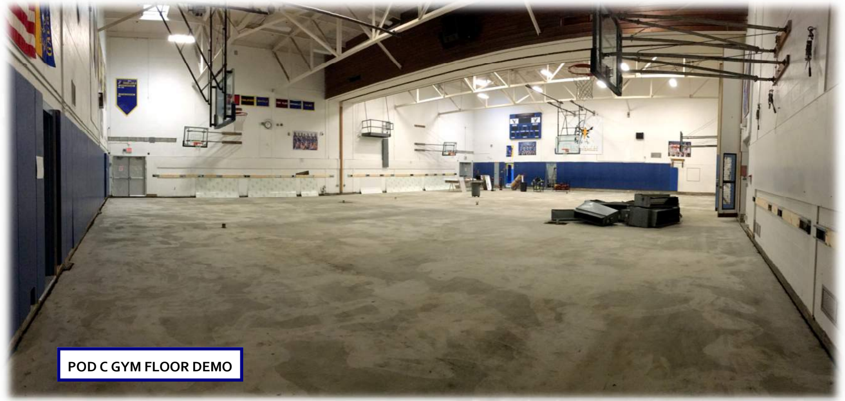
POD C GYM FLOOR DEMO