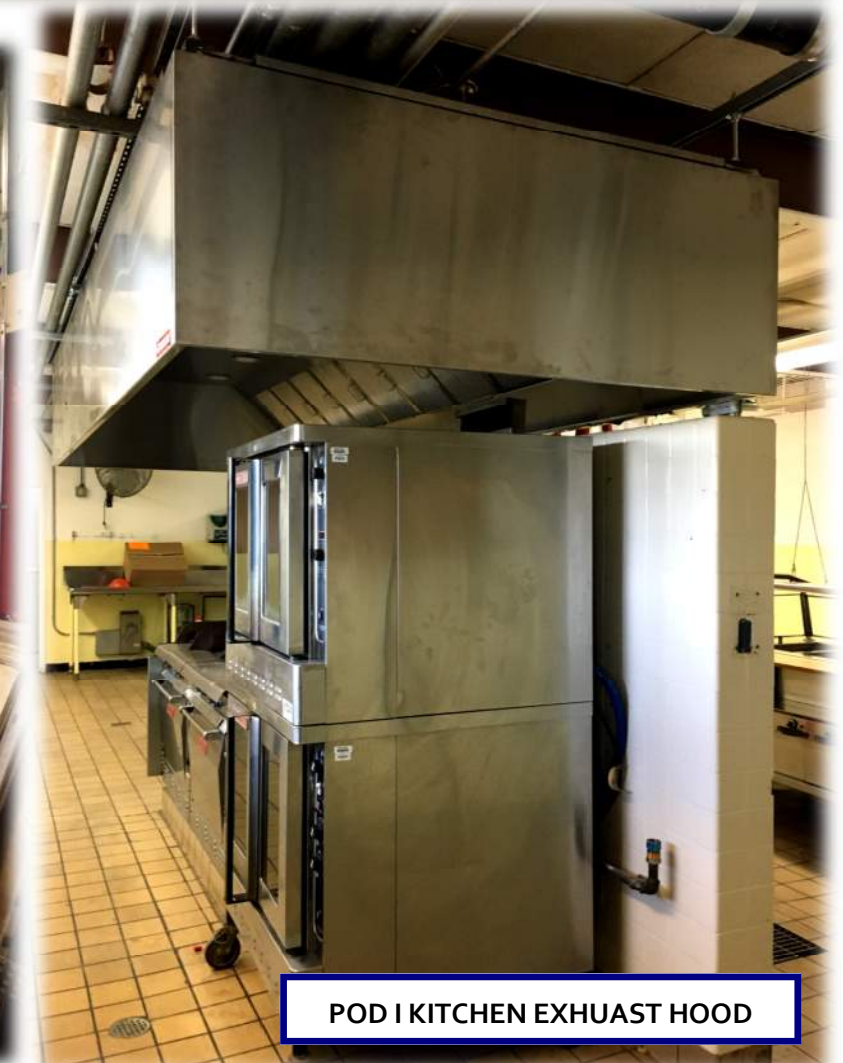
POD I KITCHEN EXHAUST HOOD