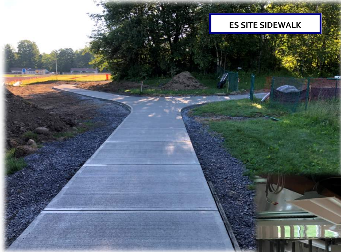
ES SITE SIDEWALK