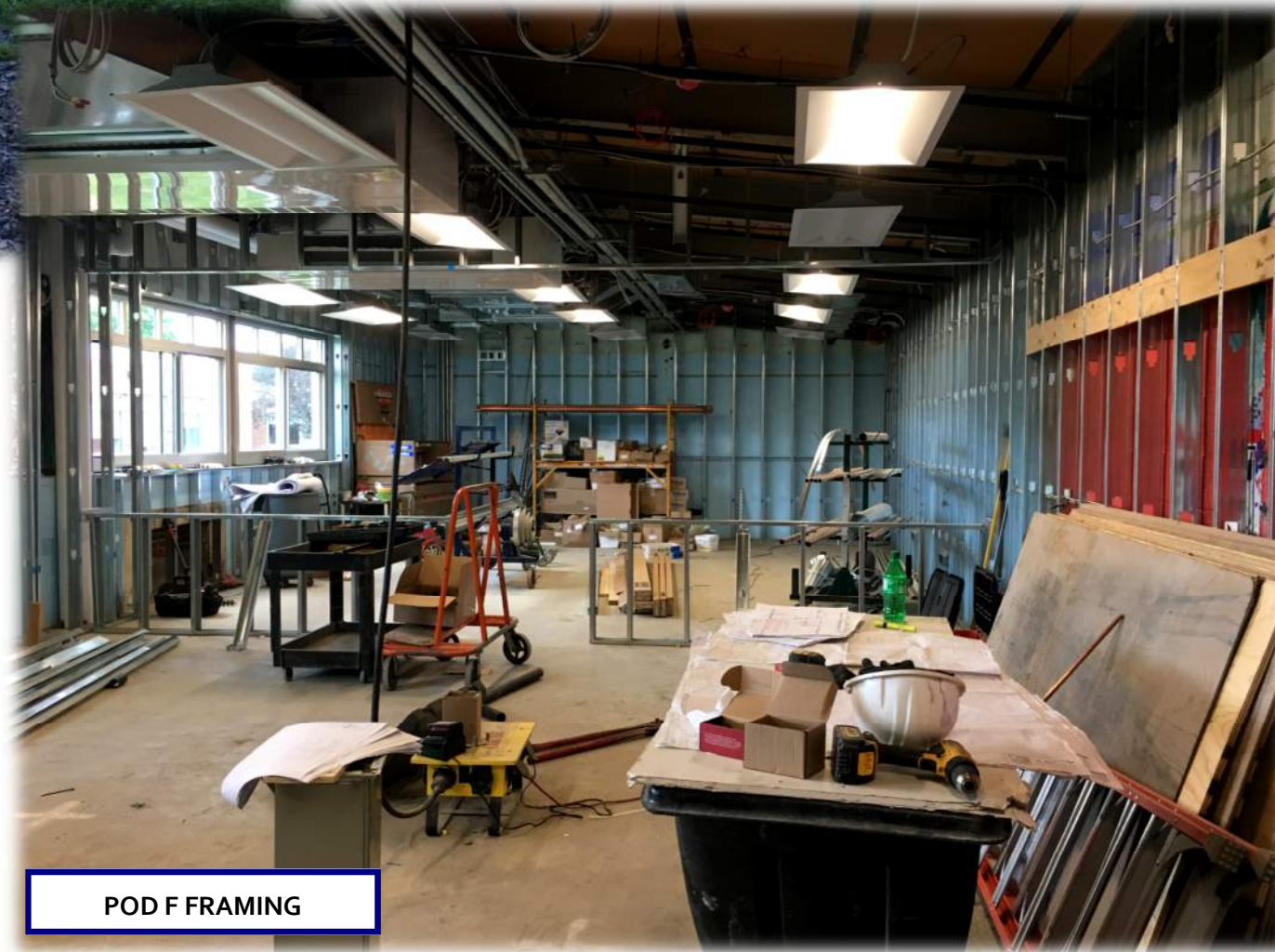
POD F FRAMING