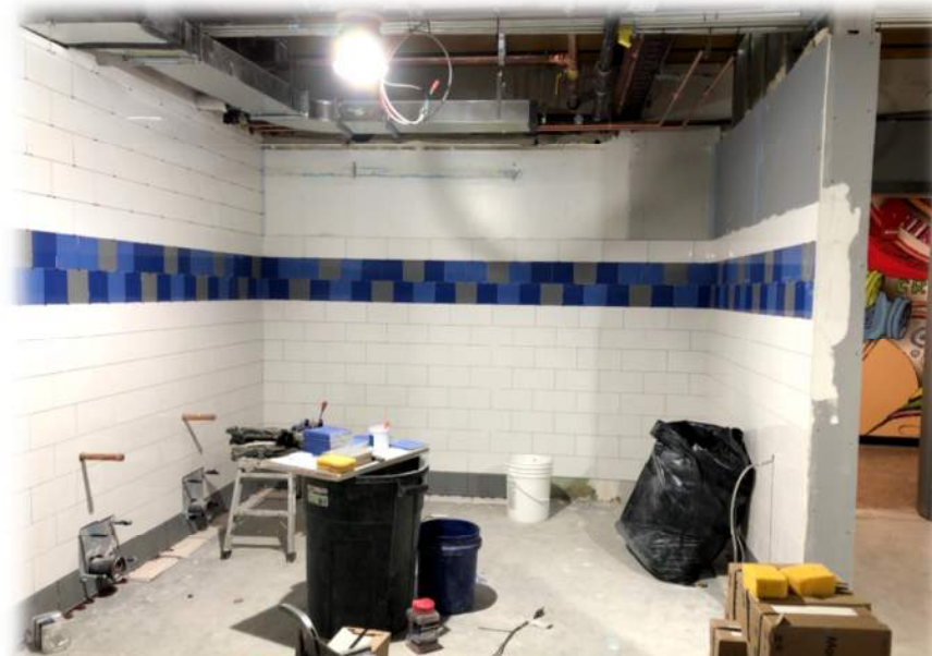
POD I BATHROOM RECONSTRUCTION