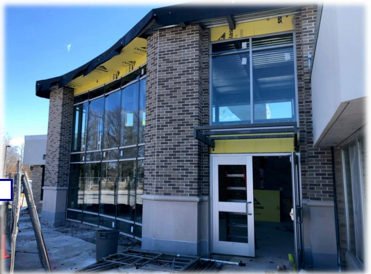
POD J VESTIBULE STOREFRONT AND MASONRY